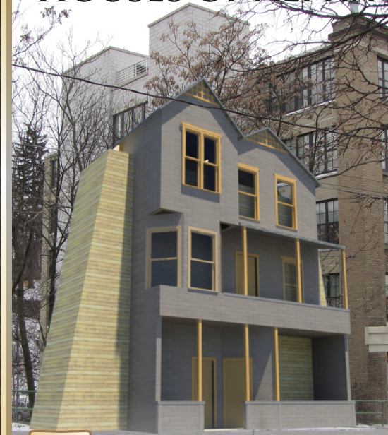
FUTURE RESTORATION OF 411 EAST STATE ST., ITHACA, NY