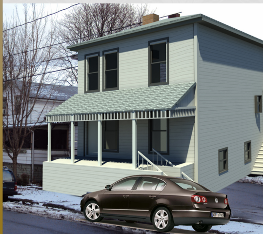
FUTURE RESTORATION OF 421 NORTH ALBANY ST., ITHACA, NY

ALPHA PHI ALPHA EDUCATION FOUNDATION 2313 ST. PAUL ST. BALTIMORE, MD 21218